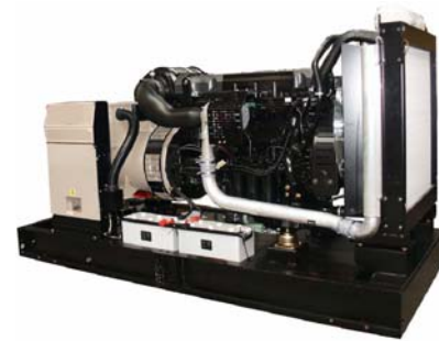
KV300U Shown; KV350 is Similar