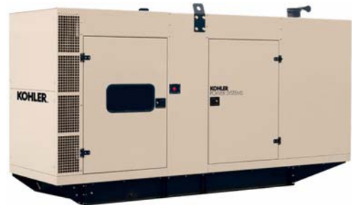
With Available Enclosure Accessory